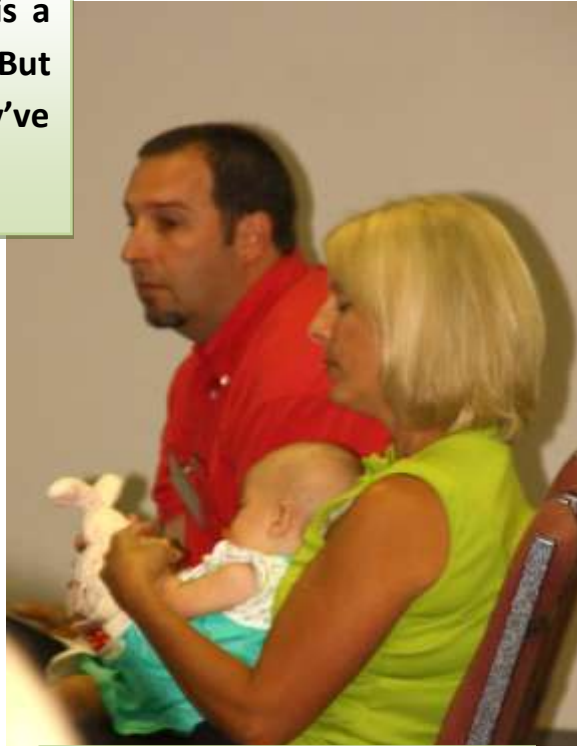
Our youngest member